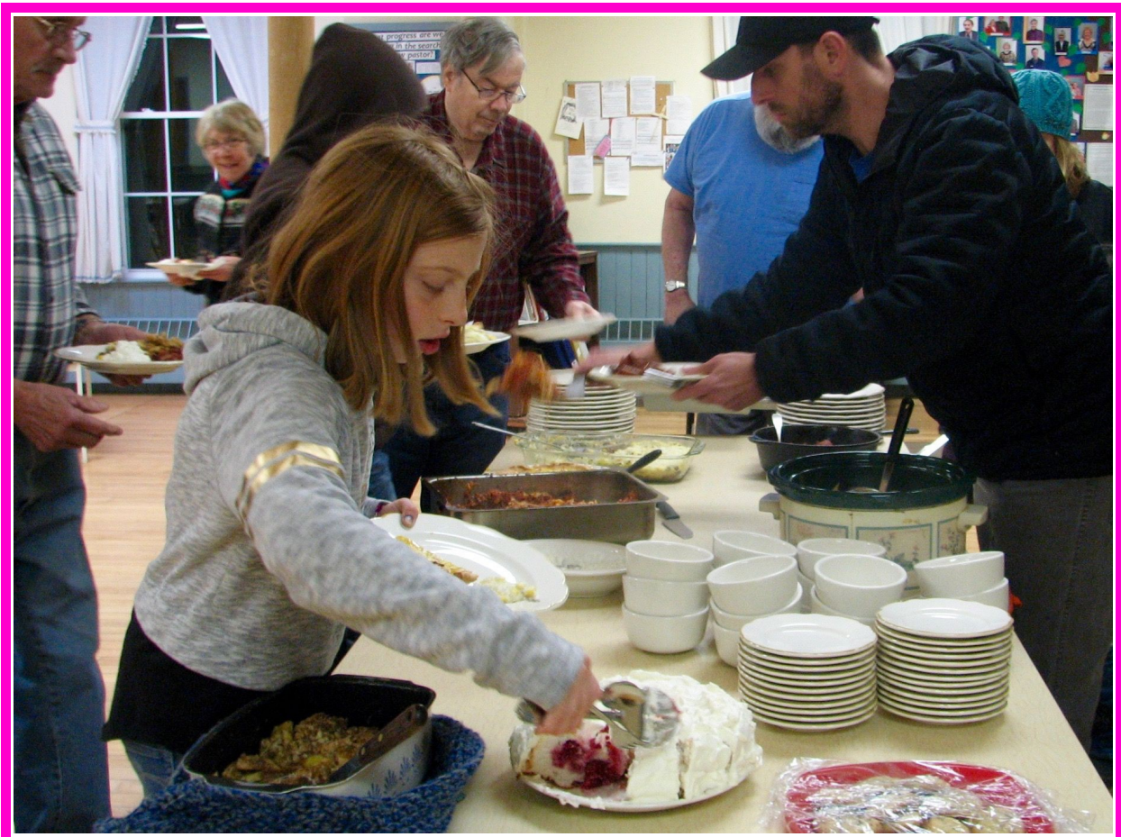
Always plenty for everyone at Community Supper