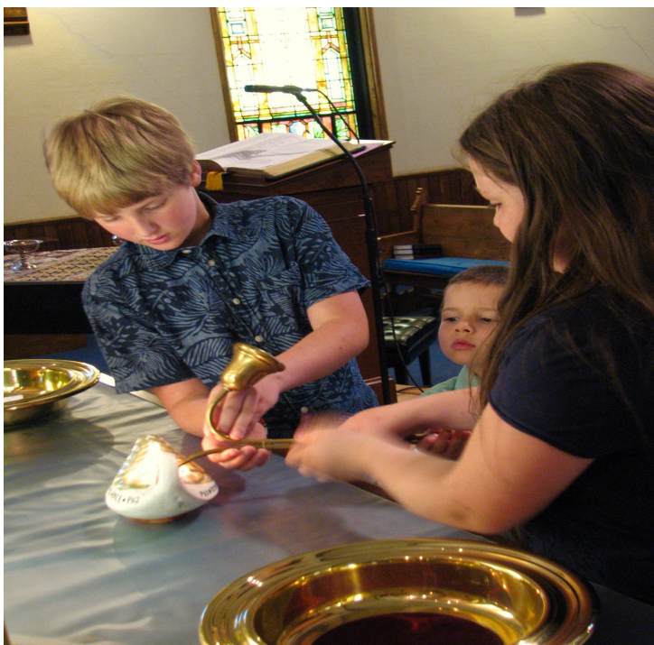
Lighting the Peace Candle

The children really enjoyed performing the various duties during the service and singing "This Little Light of Mine" for you all.