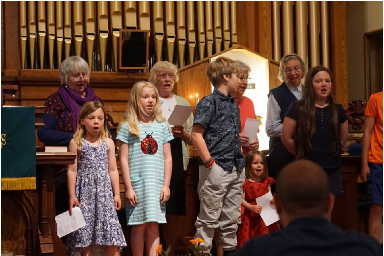
This Little Light of Mine

On behalf of the Sunday school children and teachers, I want to thank you for your support throughout the year and your attendance at Children's Sunday on June 10th.