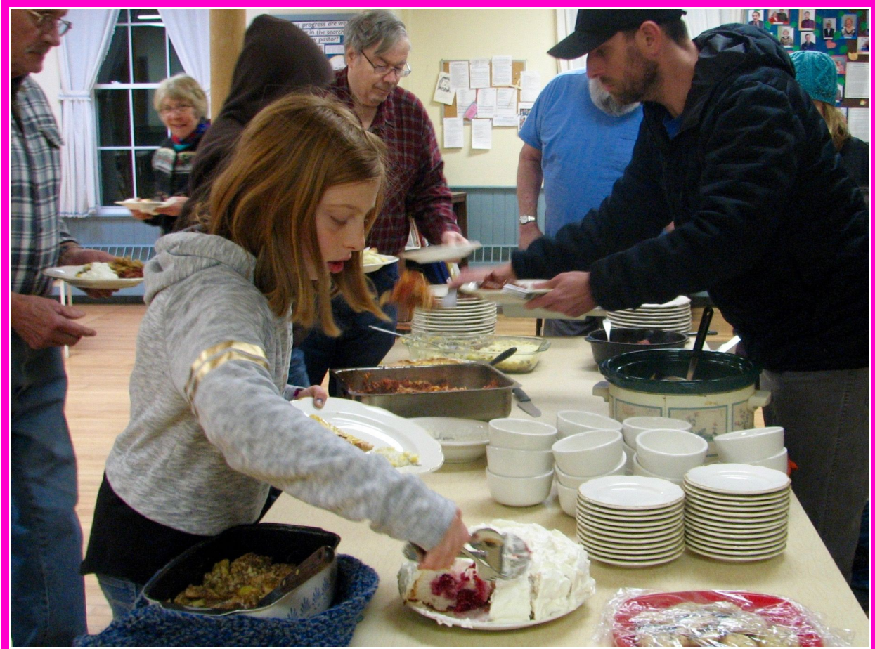
Always plenty for everyone at Community Supper