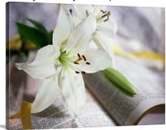
our time ... spreading the Good News

The theme hymns are linked to video performances ... click on each if you desire listening to hymns as you read your scriptures or meditate on them