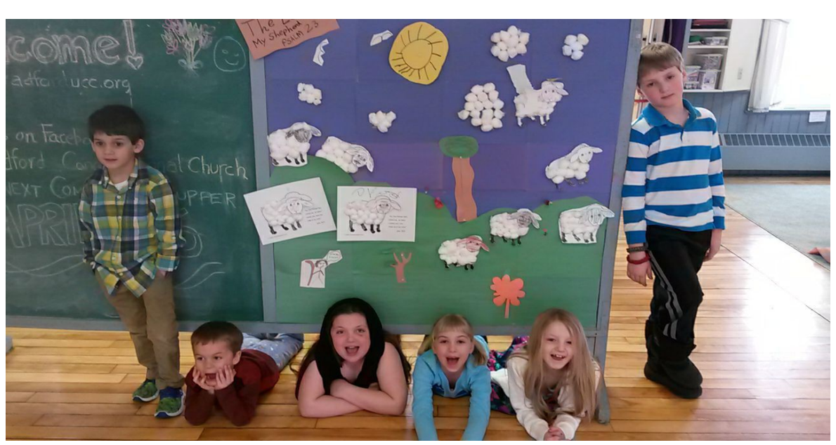
Children's Sunday is June 10th