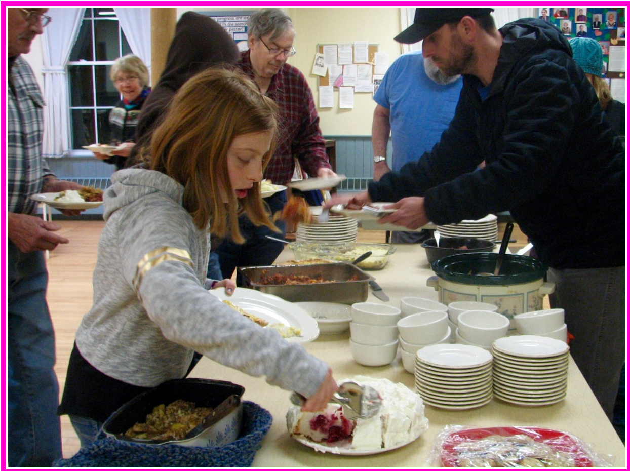
Always plenty for everyone at Community Supper