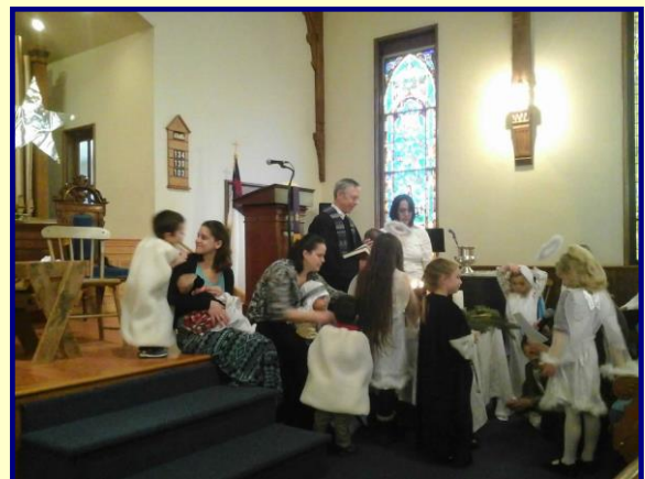
Lighting the JOY candle