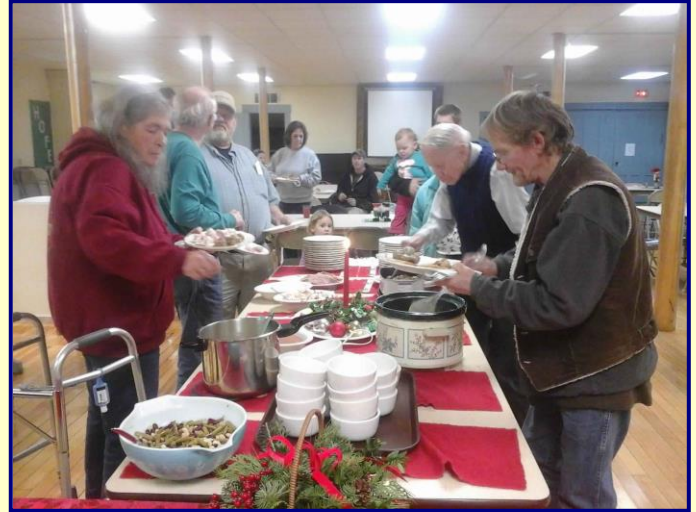
On De. 16 th we gathered for our monthly Community Supper ... great food and fellowship!