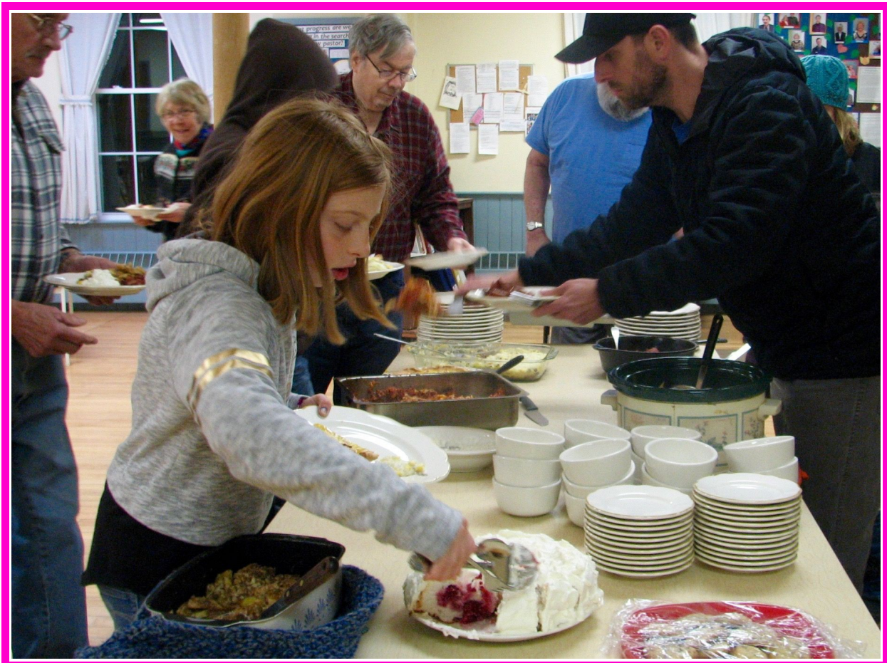
Always plenty for everyone at Community Supper

The next Supper will be May 24 th at 6pm. Hope you can join us!