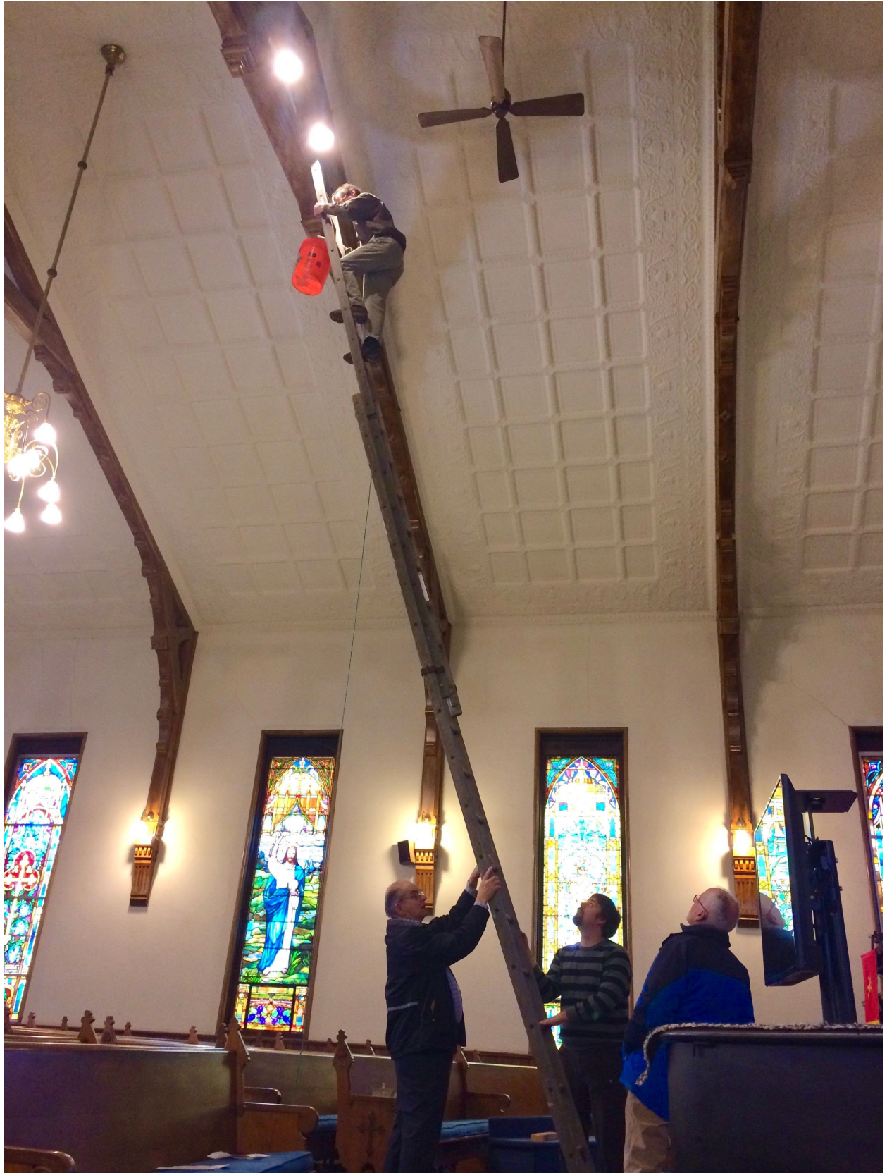
Illustration 1: It takes many hands and lots of courage to change THIS lightbulb!