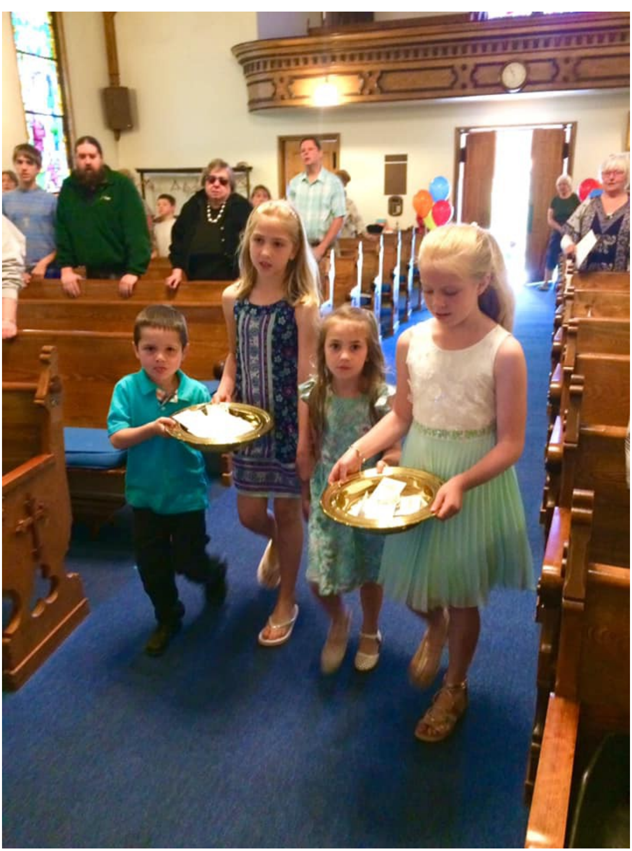
Many helpimg hands for the offering!