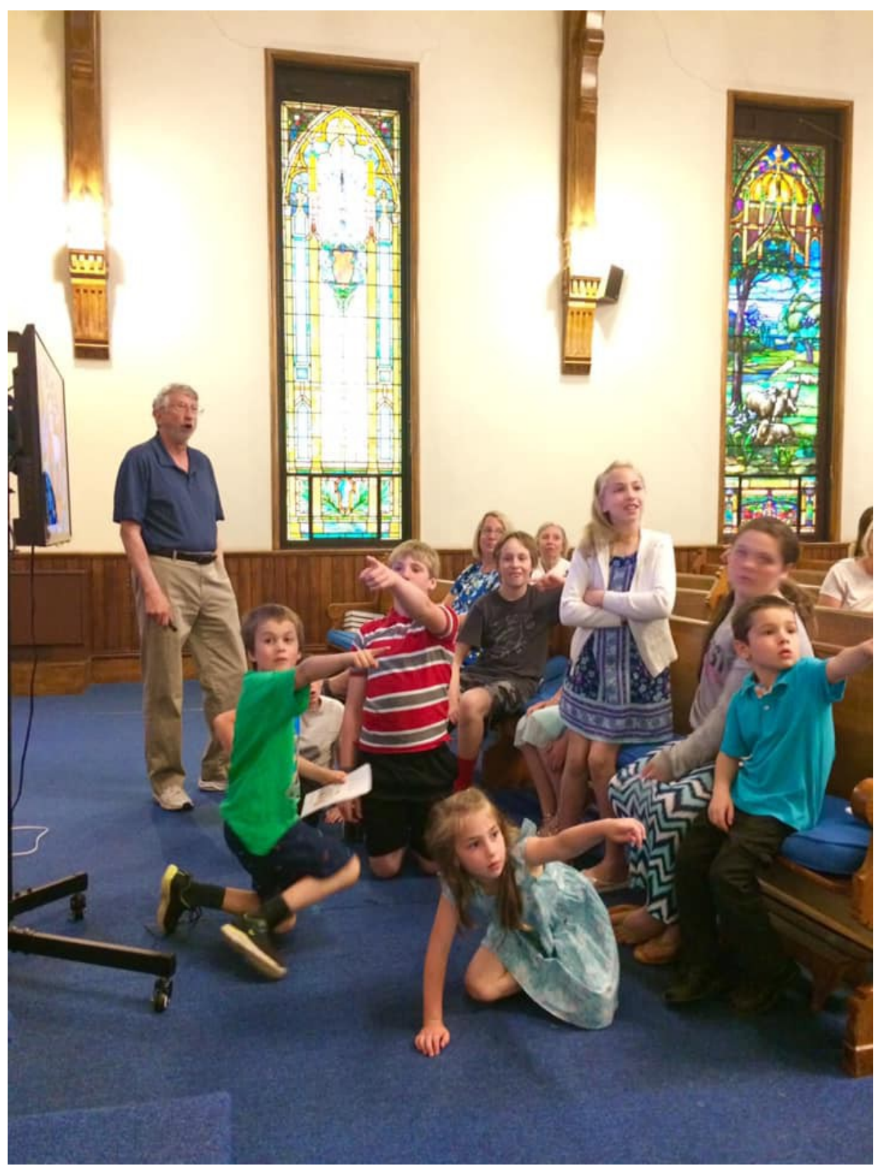
Eye-Spy ... crosses!