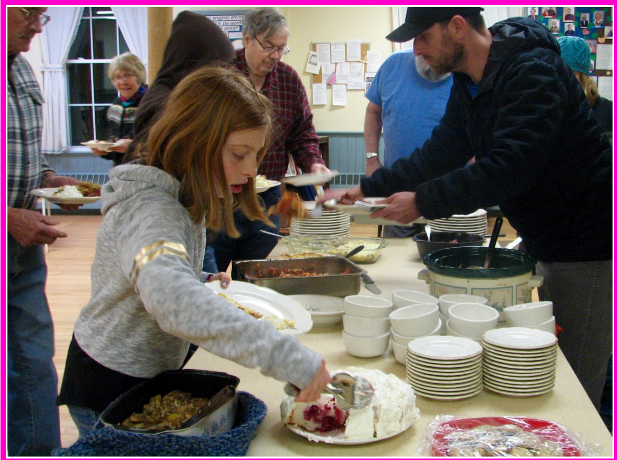
Always plenty for everyone at Community Supper